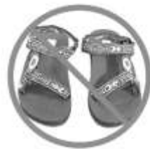
Sandals or Slippers

Participants are requested to arrive in a timely fashion for all addresses, whether to their own, or to those of other presenters. Presenters are reminded that the time slots should be divided fairly and equally between the number of presentations, and that they should not overrun. The session chair is asked to assume this timekeeping role and summarize clarify key important issues in each topic