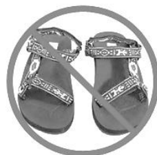
Sandals or Slippers

Participants are requested to arrive in a timely fashion for all addresses, whether to their own, or to those of other presenters. Presenters are reminded that the time slots should be divided fairly and equally between the number of presentations, and that they should not overrun. The session chair is asked to assume this timekeeping role.