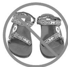
Sandals or Slippers

Participants are requested to arrive in a timely fashion for all addresses, whether to their own, or to those of other presenters. Presenters are reminded that the time slots should be divided fairly and equally between the number of presentations, and that they should not overrun. The session chair is asked to assume this timekeeping role.