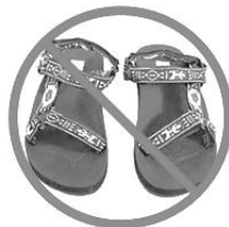
Sandals or Slippers

Participants are requested to arrive in a timely fashion for all addresses, whether to their own, or to those of other presenters. Presenters are reminded that the time slots should be divided fairly and equally between the number of presentations, and that they should not overrun. The session chair is asked to assume this timekeeping role.